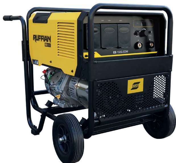
Ruffian ES 150G EDW