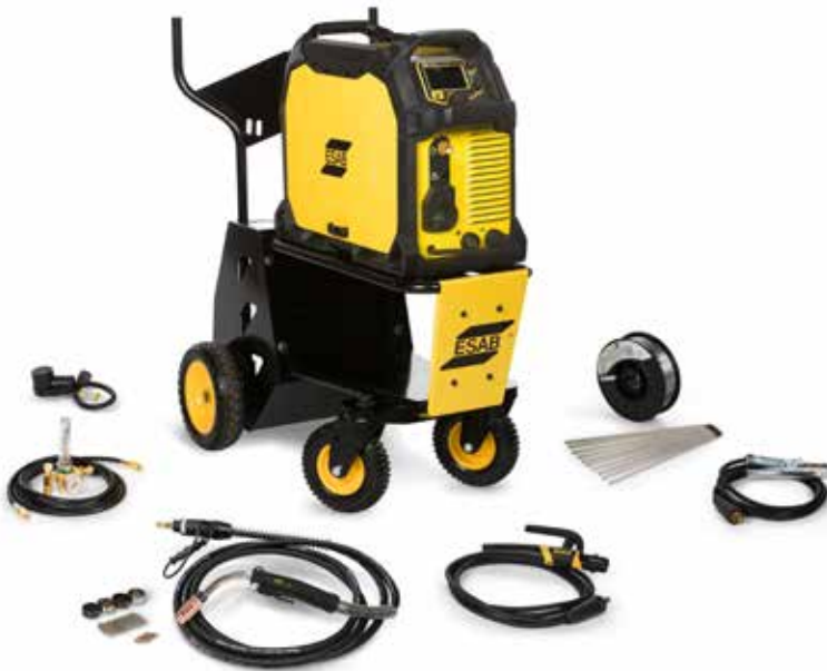
Rebel EMP 285ic with cart and accessories.