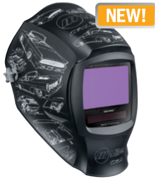
'22 Custom Kindig-it 292933